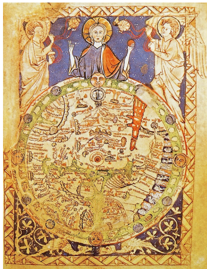
Medieval map, with Jerusalem at the center and flanked by angels

Friday's events culminated in the annual reception and Reader's