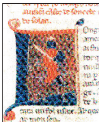
In this illuminated capital “L” we see a depiction of Peire de Meinsac, whose vida is written in the rubric above. The song that begins with this “L” is “Longa Sazon.”