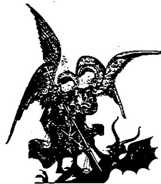
"Prayer for a Soul in Purgatory." From Jacobus de Voragine, The Golden Legend (1948) p. 650.

The brainchild of Comparative Literature