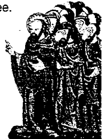
"Prayer for a Soul in Purgatory." From Jacobus de Voragine, The Golden Legend (1948) p. 650.